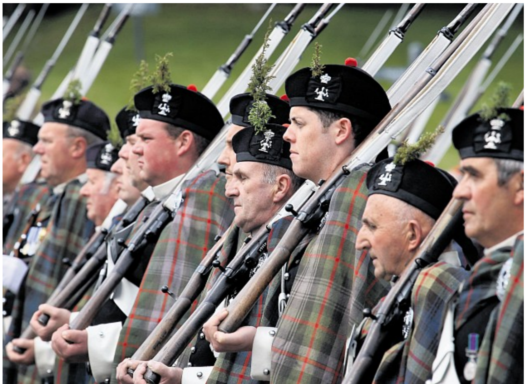
STEP IN LINE: The Duke of Atholl handed out Juniper sprigs to new recruits and long-service awards to the Highlanders